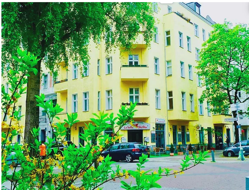
Frontview of the building