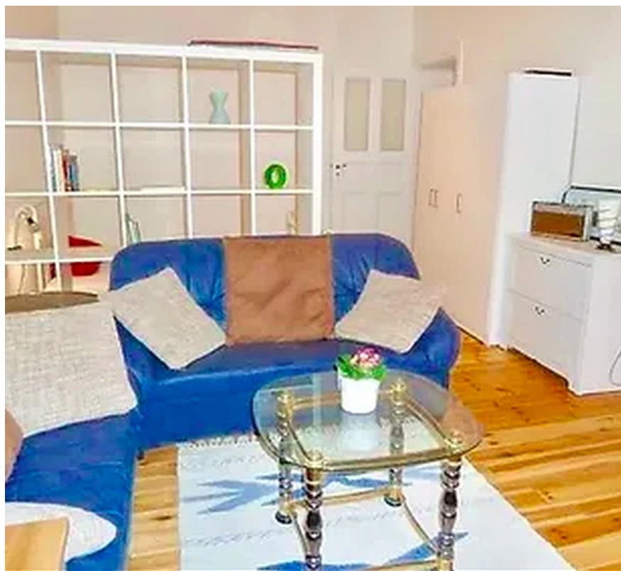
Spacious living room