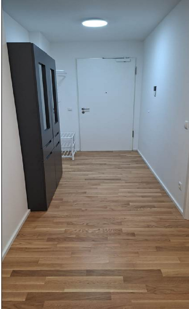
Exit of the flat: