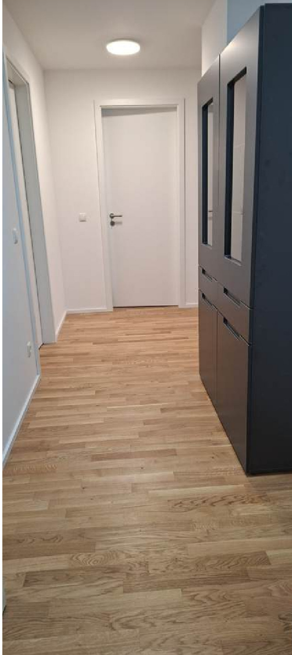
Entrance of the Flat: