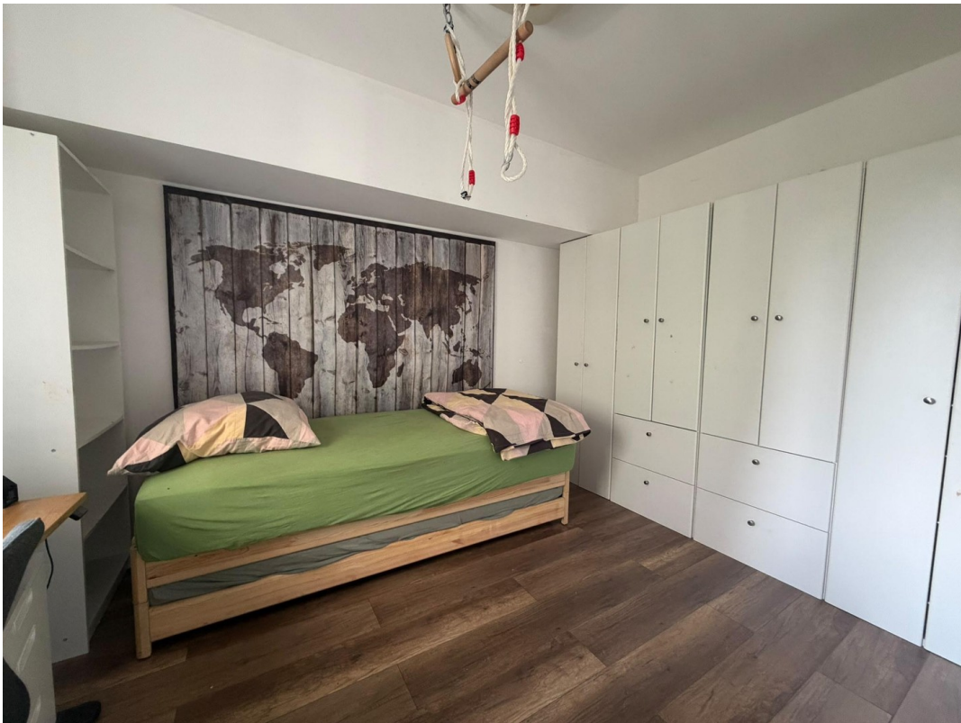
Small Bedroom 1