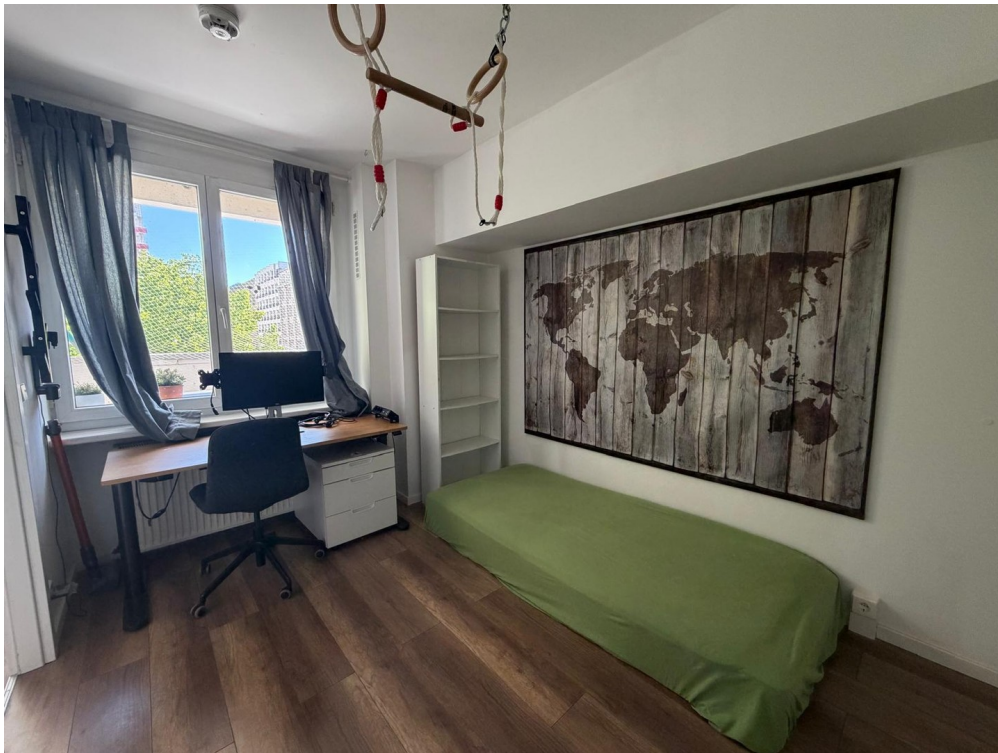
Small Bedroom 2