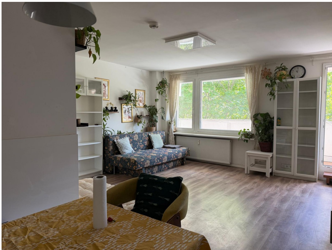
Living Room 3