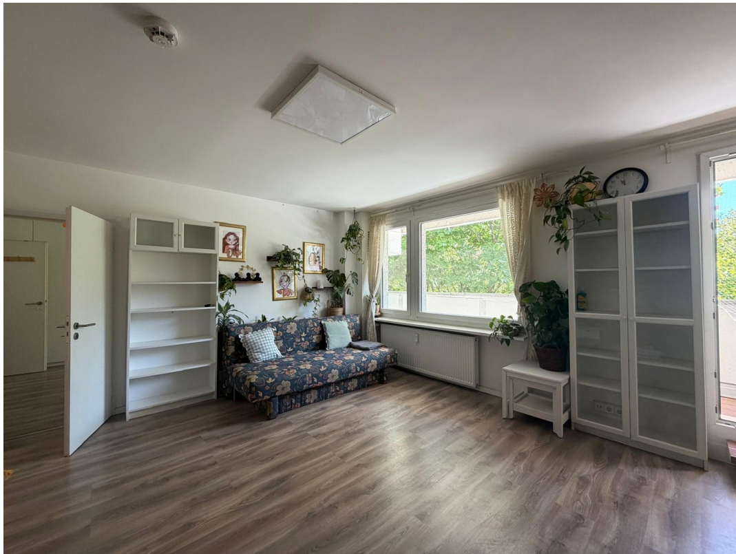
Living Room 1