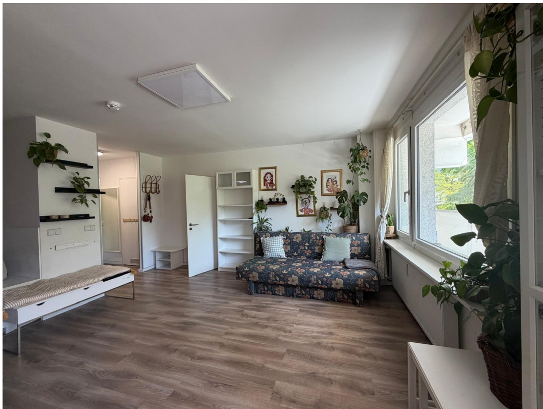
Living Room 2