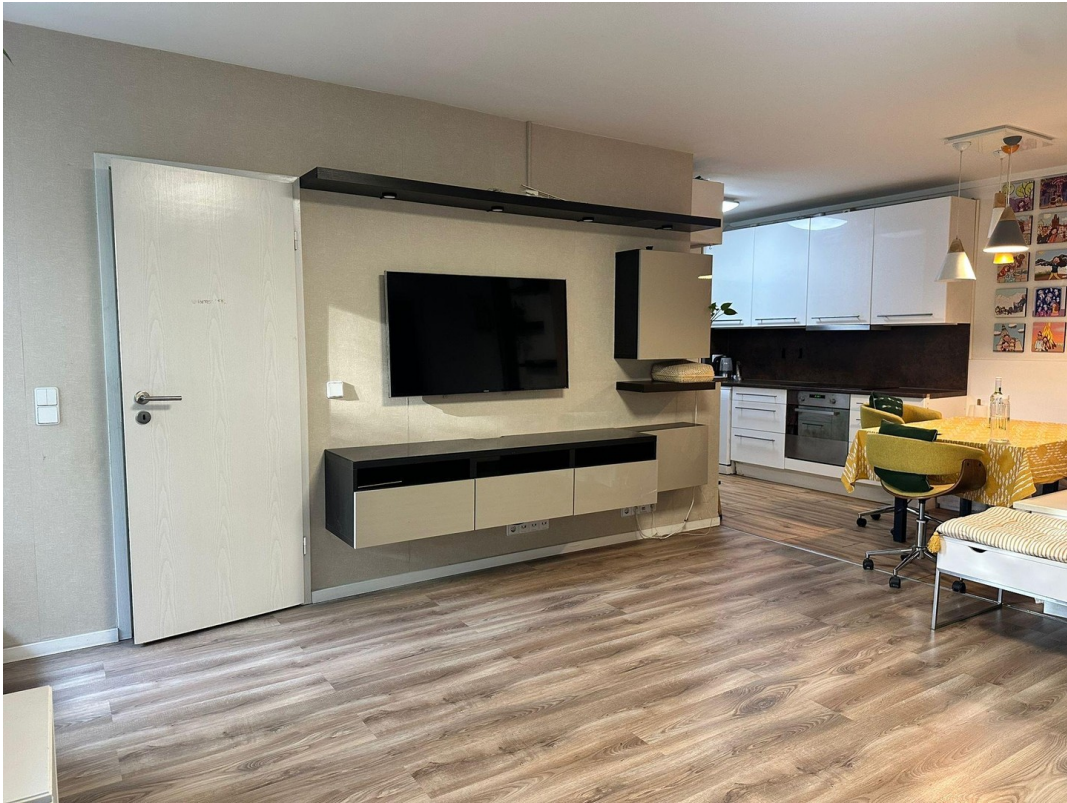
Living Room 4