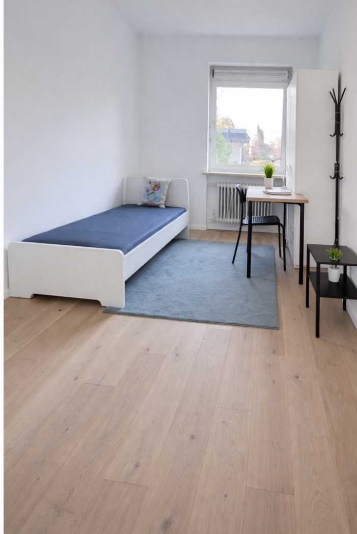
Private Room - Single Person