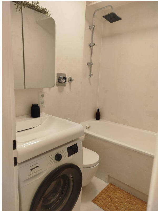
Washingmaschine in bathroom