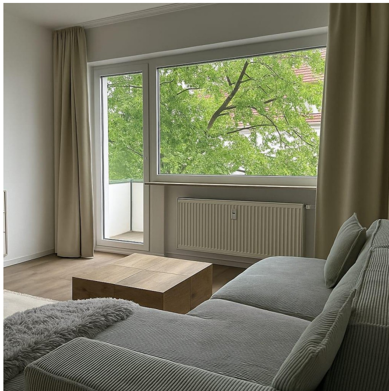
View from Sofa to Balcony