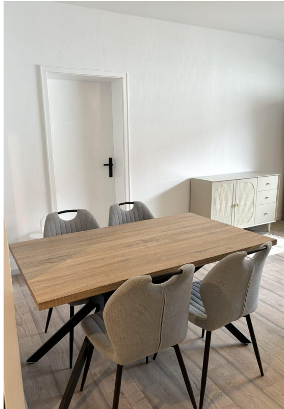
Dining table for max. 6